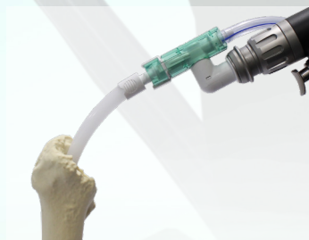
P30 Series - secure nozzle connection prevents leaks and breakages

Our Stryker® compatible P31 series pump kits operate directly with any Stryker® large rotary bone handpiece (System 7 and 8)