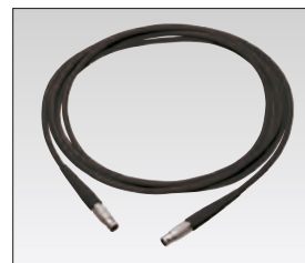
4 metre cable for connecting and charging foot pedals via power console.