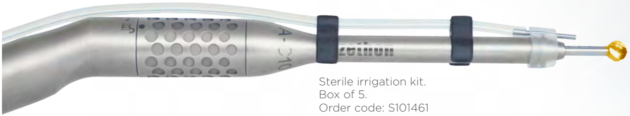
Sterile irrigation kit. Box of 5. Order code: S101461