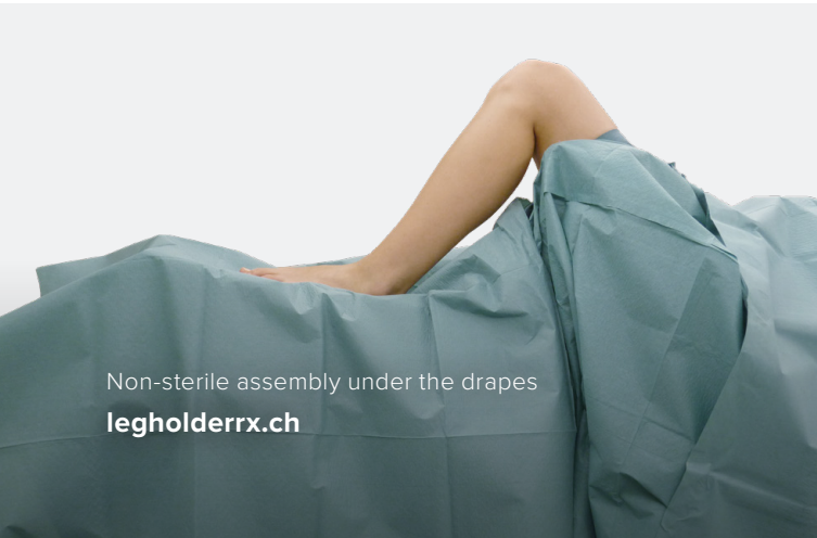
Non-sterile assembly under the drapes legholderrx.ch